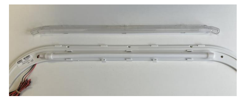
3. Remove rubber LED strip from clear plastic lens