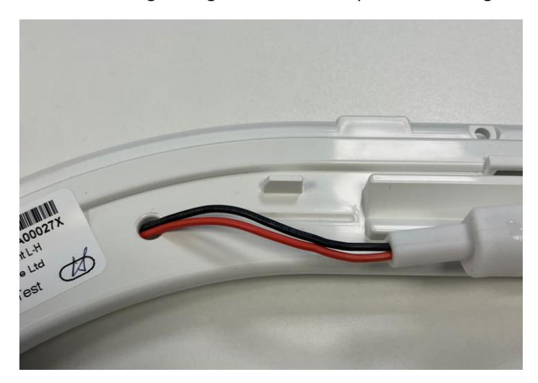
5. Reverse the direction the light and wiring