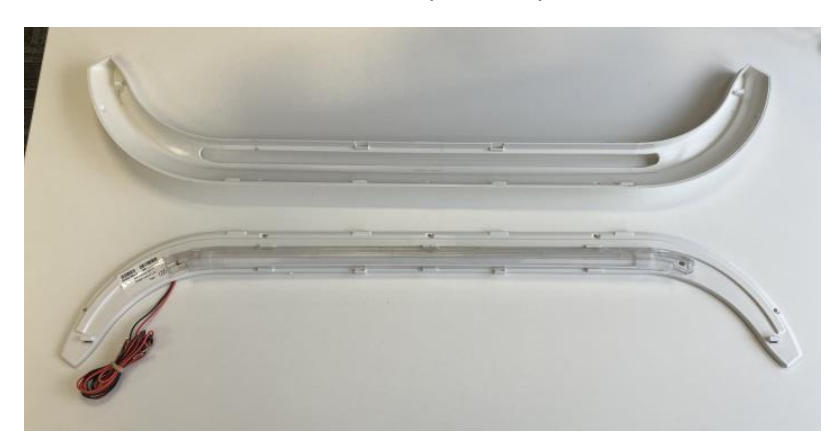
2. Unclip clear plastic lens